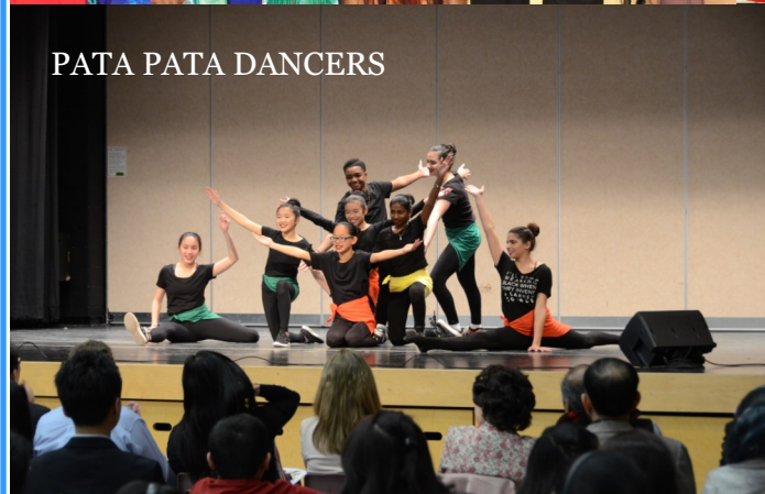
PATA PATA DANCERS