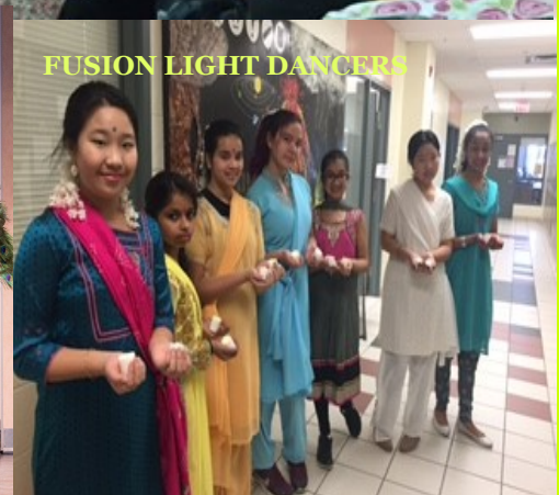
FUSION LIGHT DANCERS