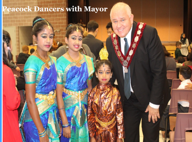
Peacock Dancers with Mayor