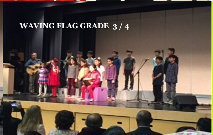
WAVING FLAG GRADE 3 / 4